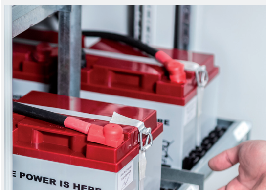
Fig.1 Wäertsilä JOVYBATT BC